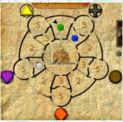
Placing cubes in the Museum: Green places a green cube from the general stock into the Museum. It is Green's first cube in the Museum, so rooms with a '5' value are not available. It is also impossible for Green to put a cube in rooms that are already occupied, so he/she decides to place a cube in the room situated between the wings of Lord Lemon and Mrs. Blackmore.

Players keep the cubes they have not used during this season; they will be able to use them in the next season.