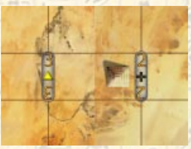
Fig. 2: an area