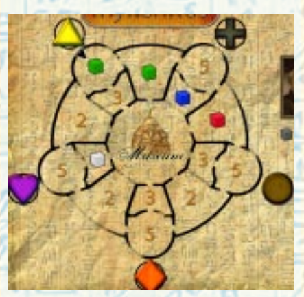
Placing cubes in the Museum (cont'd): While surveying another area, Green chooses to place another cube in the Museum. Since there already is a green cube between Lord Lemon's and Mrs. Blackmore's wings, both '5'- valued rooms are now available. Green may also choose to put a cube in any unoccupied room with a value of 2 or 3. Finally, Green decides to place a man in Lord Lemon's room '5', which, from now on, is not available to other players.