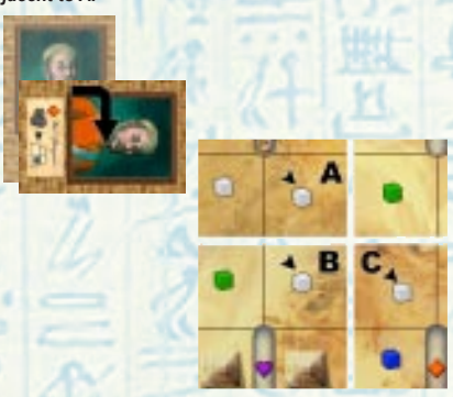
White tilts a card featuring Colonel Tangerine. Then, White extends one of his/her excavations by placing three cubes on spaces A, B and C.

Red tilts a card featuring Mrs. Blackmore, and puts one cube on A and the other one on B, which is adjacent to A.