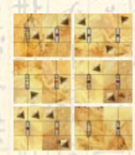
Fig. 1: a region

The various areas which make up a region may be separated by a space to make them easier to differentiate. However, areas are considered adjacent. Thus, two spaces which are side-by-side orthogonally (but not diagonally) on two different cards are considered adjacent (fig.3). What is more, cartouches are not considered as obstacles. As a consequence, two spaces separated by a cartouche are considered adjacent.